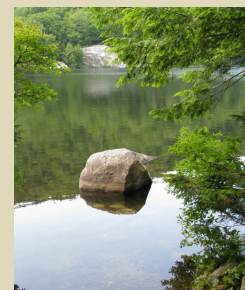
Little Rock Pond